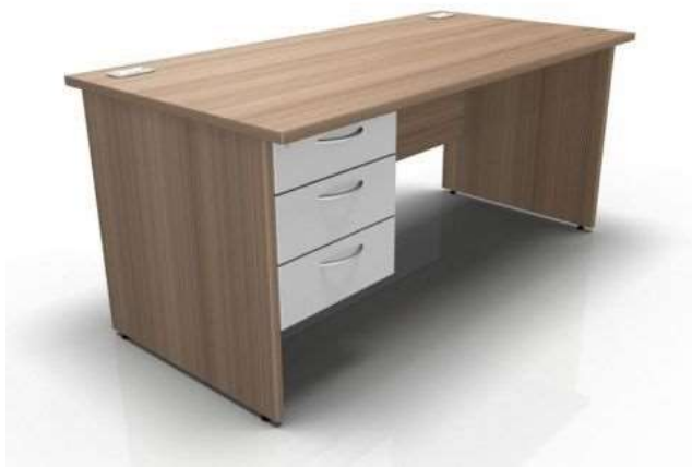
Office table (03) (5 feet X 3 feet X (29-32 )inch)